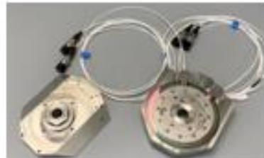
Flat Form Factor Design